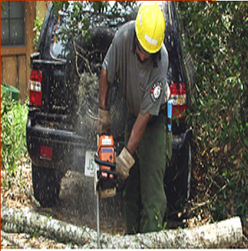
This picture shows actual disaster site work conditions and may not illustrate proper safety and health procedures.