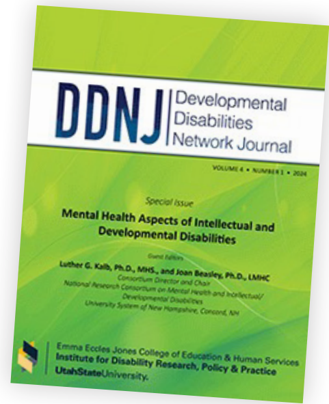
The image shows the front cover of the Developmental Disabilities Network Journal (DDNJ)